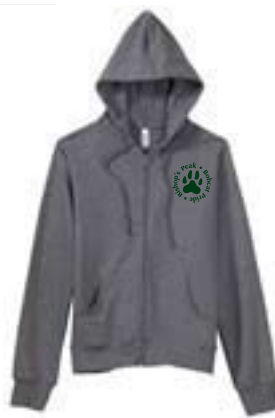
Ladies Zip Hoodie