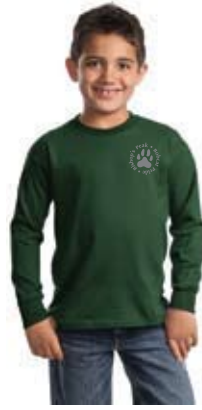
Youth LS Tee