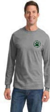
Mens LS Tee