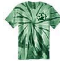
Youth Tie Dye