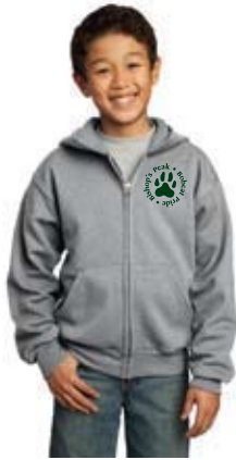
Youth Zip Hoodie