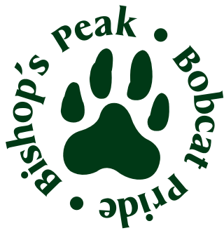
Left Chest Logo