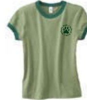
Girls Ringer Tee