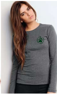
Ladies LS Tee